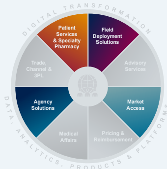
Integrated Solutions to Overcome Any Challenge